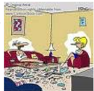
"If I knew I wanted you to stop going to these summer classic car shows as you would spend more time at home, well, I changed my mind."