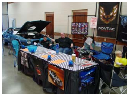
Club Booth at the 2007 Make a Wish Car Show

Hopefully we will have numbers in April for the $$ amount raised.