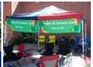
Starting the parade!